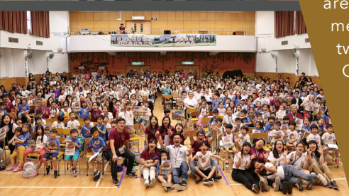
2019 VBS Graduation in One of Our Schools

As far as local schools are concerned, the LCHKS operates 6 primary schools, 6 secondary schools and 2 special schools (one for the deaf, the other for students with special needs) which are aided by the Hong Kong government. All these schools along with 22 kindergartens and nurseries are endorsed by the Hong Kong Education Bureau. Besides, our Synod runs 6 evening secondary schools and 6 other educational centres. More than 18,000 students are served by more than 1,000 teachers and staff members in our educational system. There are also two international schools with American curriculum, Concordia International School in Hong Kong (since 1990) and Buena Vista Concordia International School in Shenzhen (since 2011). Moreover, the LCHKS and its schools, both local and international, welcome Lutheran volunteers from the US who come on a continuing basis as short-term mission teams, who serve as long-term missionaries and who help every year to launch Vacation Bible Schools (VBS). Indeed, all the time, there are plenty of mission opportunities to serve with the LCHKS in Greater China.