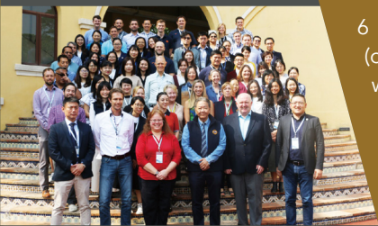
Educators from the Concordia International Schools