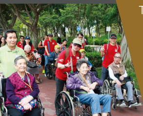
Commitment, Compassion and Community

The LCHKS practises the Lord's command to "love your neighbour as yourself" by catering for the needs of the community, particularly by caring for the disadvantaged members thereof. Hong Kong Lutheran Social Service (HKLSS) is one of the non-governmental charitable organisations in Hong Kong. At the present moment, HKLSS has a team of over 1,000 professional and quality staff members and supervises over 50 service units and is providing different kinds of services such as caring for children, youth, the elderly, families and rehabilitation and community development services. These services are provided all over Hong Kong and Macau.