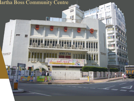
Martha Boss Community Centre

In 1986, the Martha Boss Community Centre was completed. The centre, which is the HKLSS headquarters, serves more than 100,000 residents of the Kowloon City District, including 25,000 students and over 38,000 elderly, blind, deaf and other disabled people. With God's provision and blessing, new projects are constantly emerging so that people from all walks of life can be served.