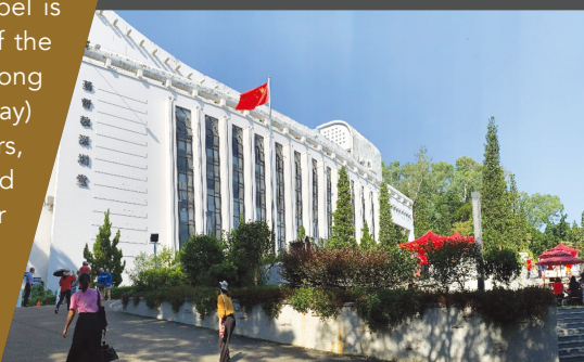
Christian (Protestant) Church in Shenzhen